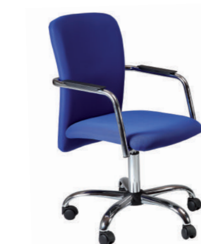
KLUB COMMUNITY CHAIR